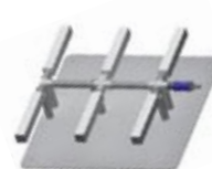
Stone Diffuser Manifold