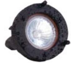
MR16 Low Voltage

*50Hz amp draw will be half of what is listed in charts.