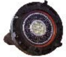
MR16 LED Low Voltage

Otterbine LED low voltage light systems come with an energy efficient 6.5W bulb that is available in a bright white (5700K) or warm white (3000K) flood lamp. System operates off 115V in 60Hz, and 220V in 50Hz; options include photocell and colored lenses. Manufactured from corrosion resistant thermal plastics, our LED light systems come standard with cable quick disconnect connection.