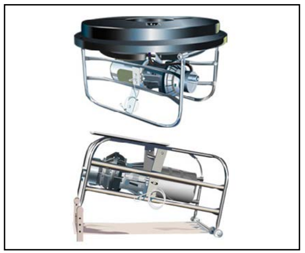
CAD DRAWING: Aspirator Industrial Aerator

ACCEPTABLE MANUFACTURER: This unit shall be an OTTERBINE Aspirator Industrial Aerator manufactured by OTTERBINE BAREBO, INC., 3840 MAIN ROAD EAST, EMMAUS, PA 18049 U.S.A. PH: (610) 965-6018. WEB: www.otterbine.com