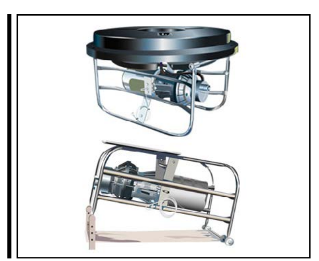
CAD DRAWING: Aspirator Industrial Aerator

ACCEPTABLE MANUFACTURER: This unit shall be an OTTERBINE Aspirator Industrial Aerator manufactured by OTTERBINE BAREBO, INC., 3840 MAIN ROAD EAST, EMMAUS, PA 18049 U.S.A. PH: (610) 965-6018. WEB: www.otterbine.com