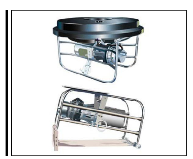
CAD DRAWING: Aspirator Industrial Aerator

ACCEPTABLE MANUFACTURER: This unit shall be an OTTERBINE Aspirator Industrial Aerator manufactured by OTTERBINE BAREBO, INC., 3840 MAIN ROAD EAST, EMMAUS, PA 18049 U.S.A. PH: (610) 965-6018. WEB: www.otterbine.com