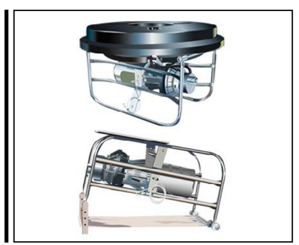
CAD DRAWING: Aspirator Industrial Aerator

ACCEPTABLE MANUFACTURER: This unit shall be an OTTERBINE Aspirator Industrial Aerator manufactured by OTTERBINE BAREBO, INC., 3840 MAIN ROAD EAST, EMMAUS, PA 18049 U.S.A. PH: (610) 965-6018. WEB: www.otterbine.com