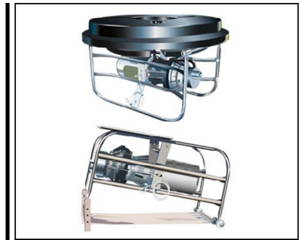
CAD DRAWING: Aspirator Industrial Aerator

ACCEPTABLE MANUFACTURER: This unit shall be an OTTERBINE Aspirator Industrial Aerator manufactured by OTTERBINE BAREBO, INC., 3840 MAIN ROAD EAST, EMMAUS, PA 18049 U.S.A. PH: (610) 965-6018. WEB: www.otterbine.com