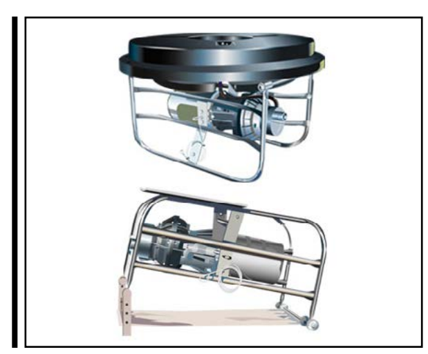
CAD DRAWING: Aspirator Industrial Aerator

ACCEPTABLE MANUFACTURER: This unit shall be an OTTERBINE Aspirator Industrial Aerator manufactured by OTTERBINE BAREBO, INC., 3840 MAIN ROAD EAST, EMMAUS, PA 18049 U.S.A. PH: (610) 965-6018. WEB: www.otterbine.com