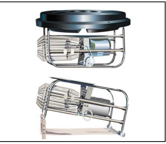
CAD DRAWING: Mixer Industrial Aerator

ACCEPTABLE MANUFACTURER: This unit shall be an OTTERBINE Mixer Industrial Aerator manufactured by OTTERBINE BAREBO, INC., 3840 MAIN ROAD EAST, EMMAUS, PA 18049 U.S.A. PH: (610) 965-6018. WEB: www.otterbine.com