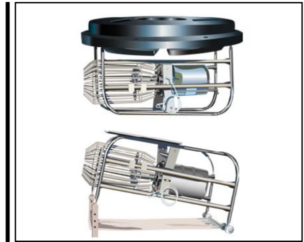
CAD DRAWING: Mixer Industrial Aerator

ACCEPTABLE MANUFACTURER: This unit shall be an OTTERBINE Mixer Industrial Aerator manufactured by OTTERBINE BAREBO, INC., 3840 MAIN ROAD EAST, EMMAUS, PA 18049 U.S.A. PH: (610) 965-6018. WEB: www.otterbine.com