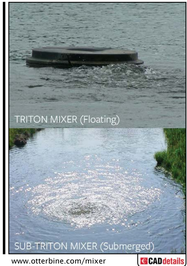
TRITON MIXER (Floating)

ELECTRICAL CONNECTORS: The electrical connectors shall consist of a receptacle and a plug constructed of non-conductive polymers. The system shall create a vacuum seal when connected and have a threaded nut system as a