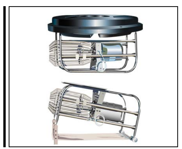
CAD DRAWING: Mixer Industrial Aerator

ACCEPTABLE MANUFACTURER: This unit shall be an OTTERBINE Mixer Industrial Aerator manufactured by OTTERBINE BAREBO, INC., 3840 MAIN ROAD EAST, EMMAUS, PA 18049 U.S.A. PH: (610) 965-6018. WEB: www.otterbine.com