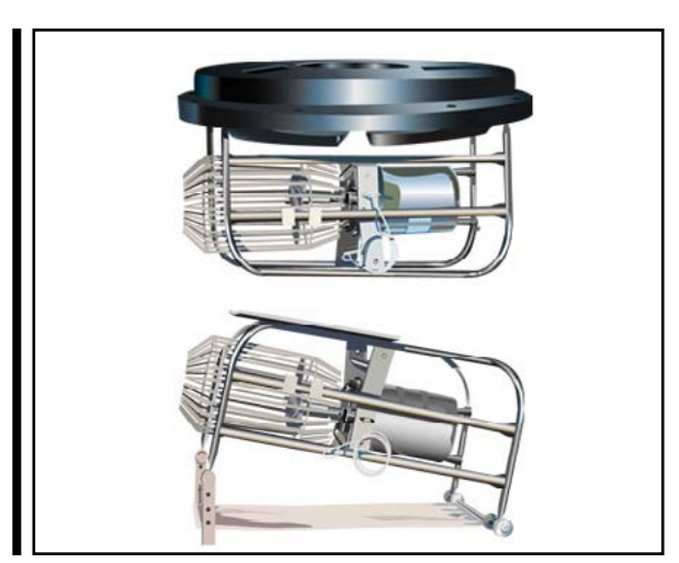
CAD DRAWING: Mixer Industrial Aerator

ACCEPTABLE MANUFACTURER: This unit shall be an OTTERBINE Mixer Industrial Aerator manufactured by OTTERBINE BAREBO, INC., 3840 MAIN ROAD EAST, EMMAUS, PA 18049 U.S.A. PH: (610) 965-6018. WEB: www.otterbine.com